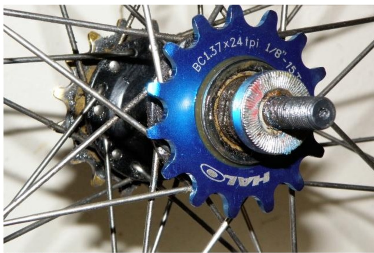
Halo Track Sprocket in situ

Halo's CNC machined track sprockets make perfect companions for production fixed wheelsets thanks to plentiful sizes, bridging the gap between the cheap, poorly machined if functional oval type commonly spotted on converted winter hacks and hand polished exotica costing the lion's share of £60. However, competition is very tight at this end of the market and some specialist brands including EAI offer marginally better detailing for similar money.